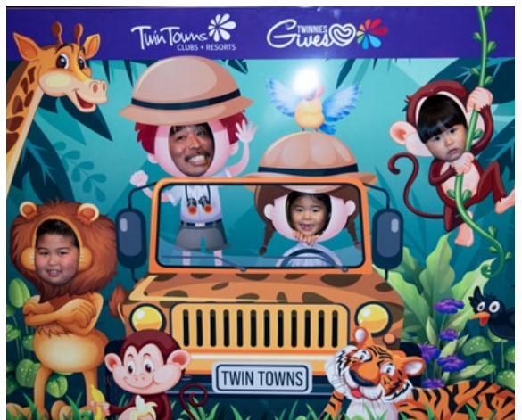
The Ota Family