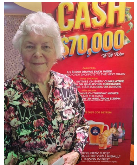
Joyce from Tweed Heads won a $28,000 jackpot in September.

*Conditions apply. NTP/10603. Twin Towns promotes and supports responsible drinking.