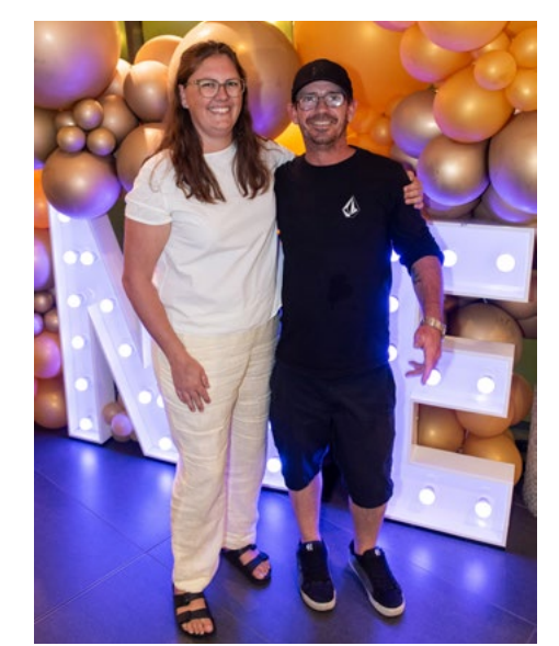
Cat and PJ from Tweed Heads