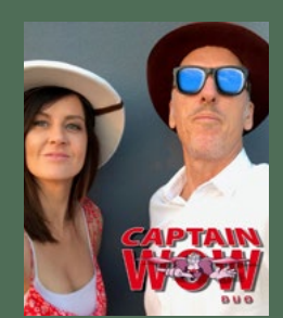
Captain Wow Duo