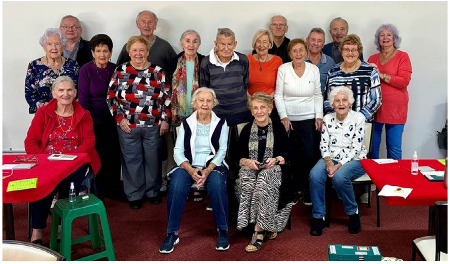
Bridge Club members

The Twin Towns Bridge Club has been in existence since 1992 and over the past 32 years, has been a boon for Bridge Players in the Tweed area.