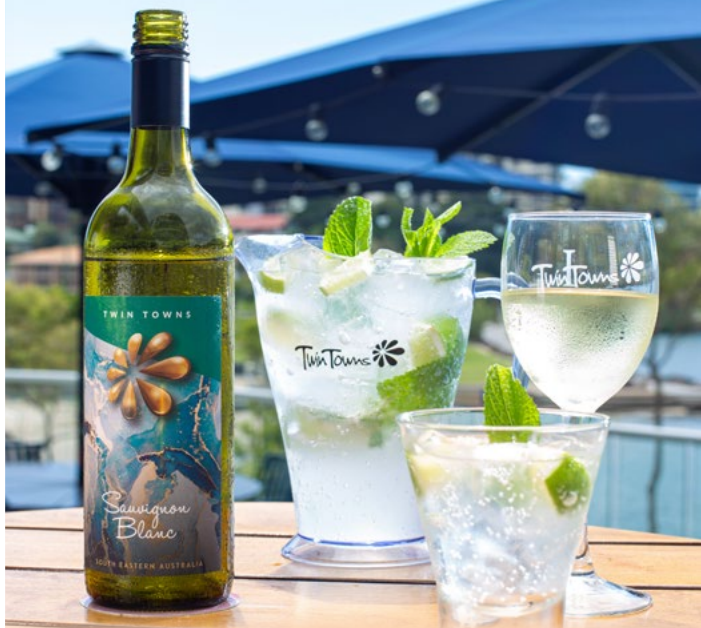
* CONDITIONS APPLY. TWIN TOWNS PROMOTES AND SUPPORTS DRINKING RESPONSIBLY.