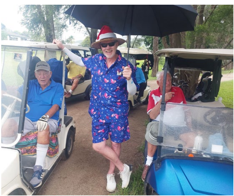
Men's Christmas Party