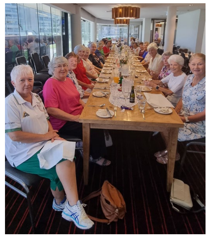
Ladies Bowlers Christmas lunch at Twin Towns